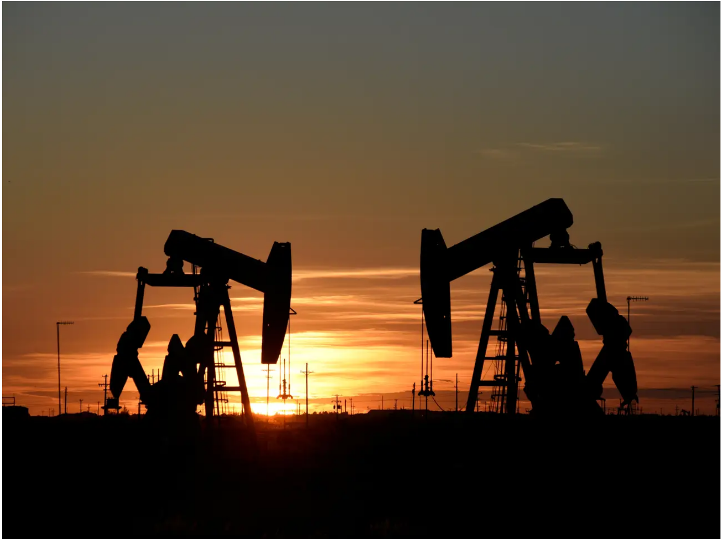
Pump jacks operate at sunset in an oil field in Midland

AI-related jobs per 100 ZipRecruiter postings: 4.7