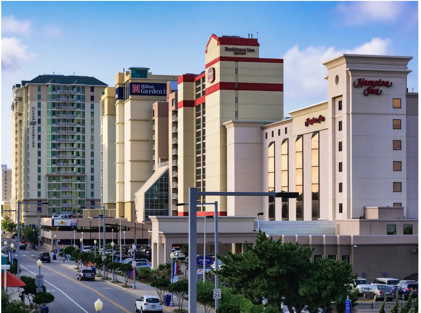
Hotels along Atlantic Avenue in Virginia Beach, Virginia.

AI-related jobs per 100 ZipRecruiter postings: 6.2