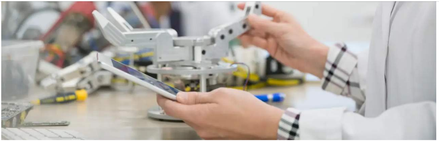
Engineer assembling robotics in factory with tablet.

Job description on O*NET: Build, install, test, or maintain robotic equipment or related automated production systems.